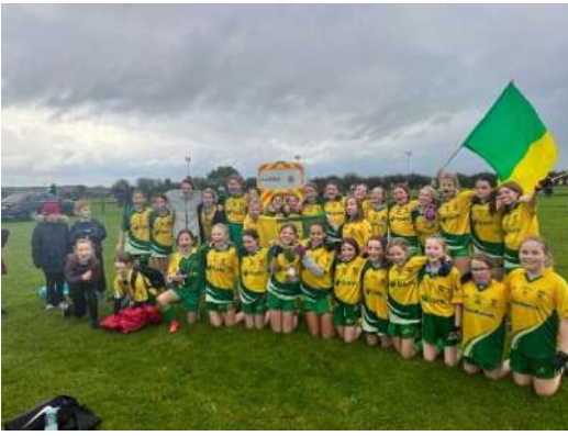
U-11 Girls County Champions