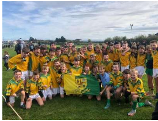
U-11 Boys County Champions