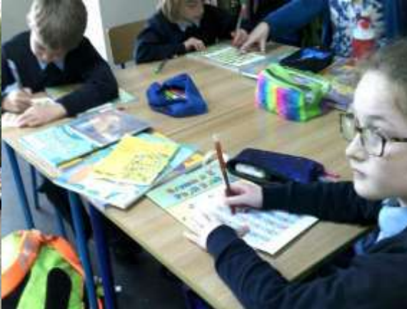
1 st Class getting ready to do their Maths trail. 2 nd Class are watching the Maths TV activity.