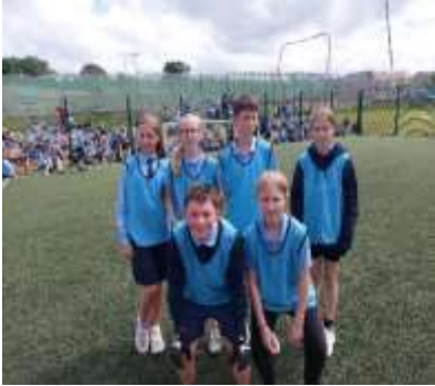
Cup Winners 2022 Macedonia