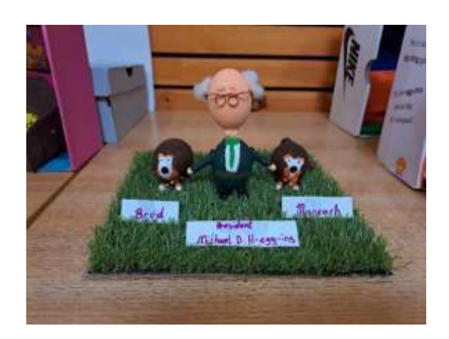
Page 11 of 16

materials and cracked on with our work. When we brought in our dioramas, we saw many shell-shocked faces from other students and teachers. Below are some eggs-amples of our work, such as Egg Sheeran, Michael D. H-egg-ins, and Our Egg-cellent Teachers.