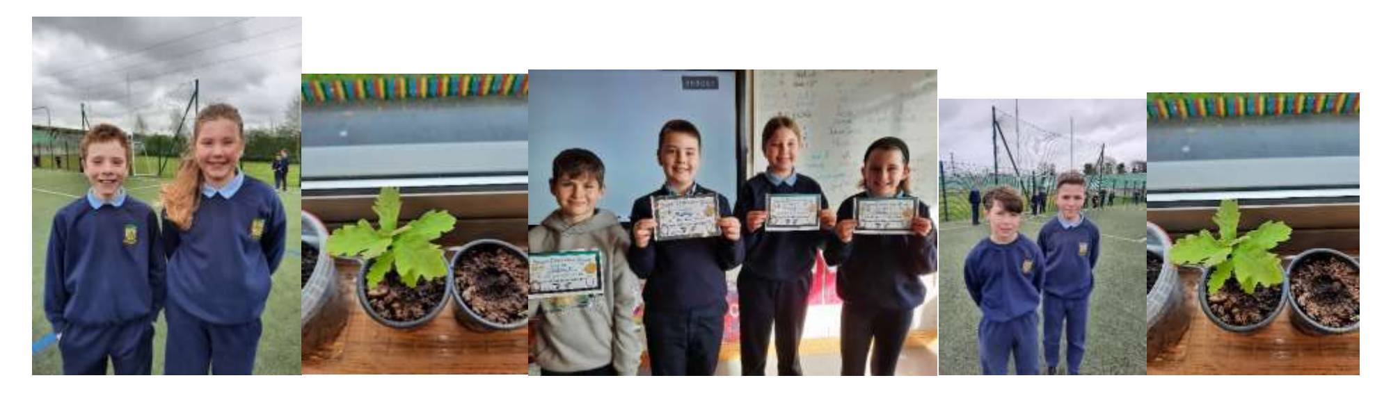
5<sup>th</sup> class News

We are growing oak trees and a chestnut tree in our classroom. Some of the oaks are struggling but we are trying to save them.